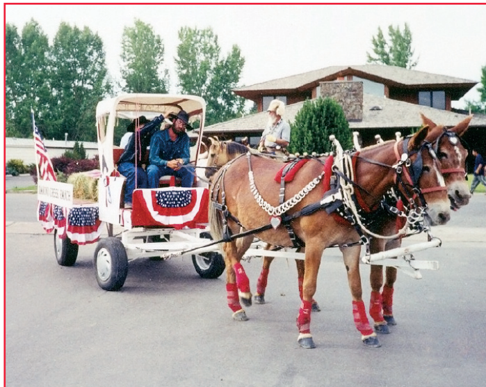
What are your plans for your mule?