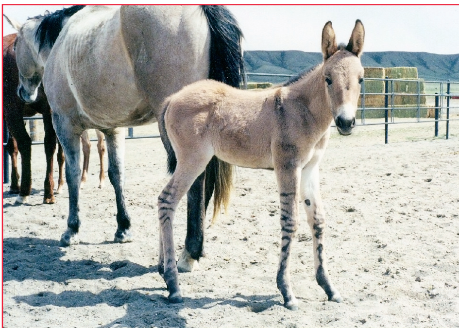
Your mule will be a result of your mare and the jack you choose

Also, be sure to look at the registration papers of the jack. If the jack is